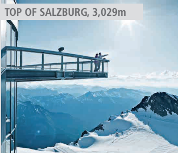
TOP OF SALZBURG, 3,029m