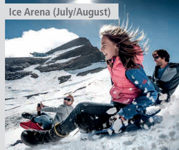
Ice Arena (July/August)